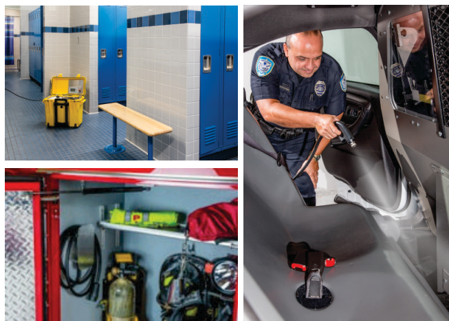
Clockwise from upper left: 1) Hands-free disinfecting of a locker room in under 30 minutes; 2) Officer hand-applying disinfectant to the rear seat of his patrol car; 3) Optional ADP-PT installed in the exterior compartment of an ambulance.